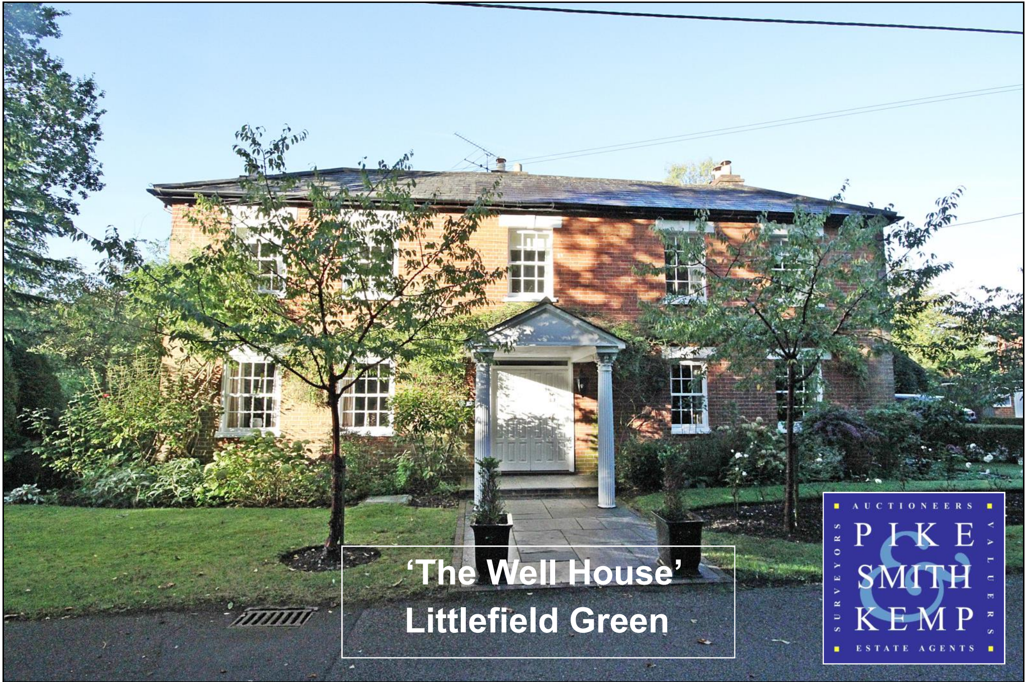
'The Well House' Littlefield Green