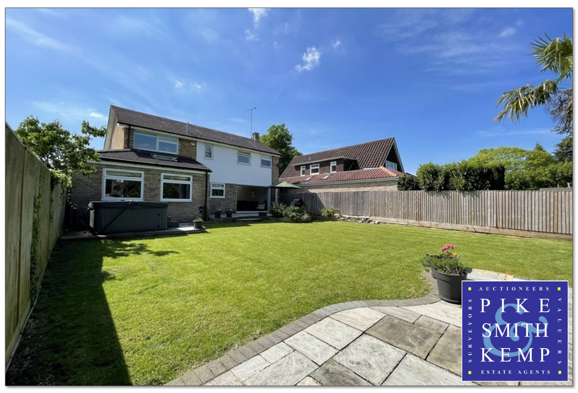
DIRECTIONS: Proceed east out of Maidenhead along the Bath Road (A4) and immediately before the Texaco garage by Maidenhead river bridge turn left into Ray Park Avenue. Continue along here for just over 1 mile and turn left into Maidenhead Court Park where the property will be found on the right hand side.